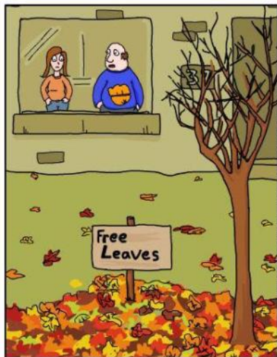
YOU SHOULD BE ASKING YOURSELF, HOW CAN THIS NOT WORK? PEOPLE LOVE FREE STUFF