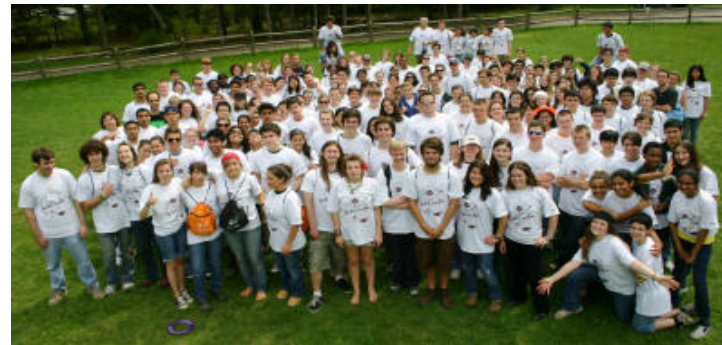
Students pose for a group photo at the 2009 Envirothon. Each year, students from around New Jersey participate in the Envirothon.

Egg Harbor Township High School sent two teams, and Middle Township High School sent a team. Each team received a $100 grant from the District for competing in the New Jersey Envirothon. The students from each team enjoyed the competition and expressed a desire in returning next year.