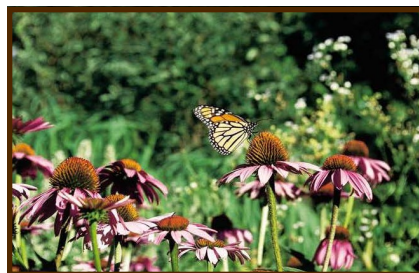
MONARCH BUTTERFLY ON A PURPLE CONEFLOWER