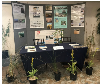
USDA-NRCS exhibitor table at the Living Shorelines Technology Transfer Workshop.

The New Jersey Plant Materials Center attended the Living Shorelines Technology Transfer Workshop which was hosted by Restore America's Estuaries in October 2021. NJPMC staff set up an exhibitor table and also displayed two posters titled, "Selecting and Evaluating Plants for Successful Performance in Coastal and Living Shoreline Systems" and "Advancing the