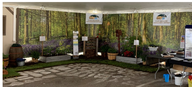
The District's display about backyard conservation will be back at the ACUA's Earth Day.

The celebration will be held on Sunday, April 24 at 6700 Delilah Road in Egg Harbor Township. There will be lots of activities from 10 am to 4 pm, including 150 vendors, crafters, food vendors, and exhibitors. Activities include facility tours, free seedling giveaways, and eco hayrides.