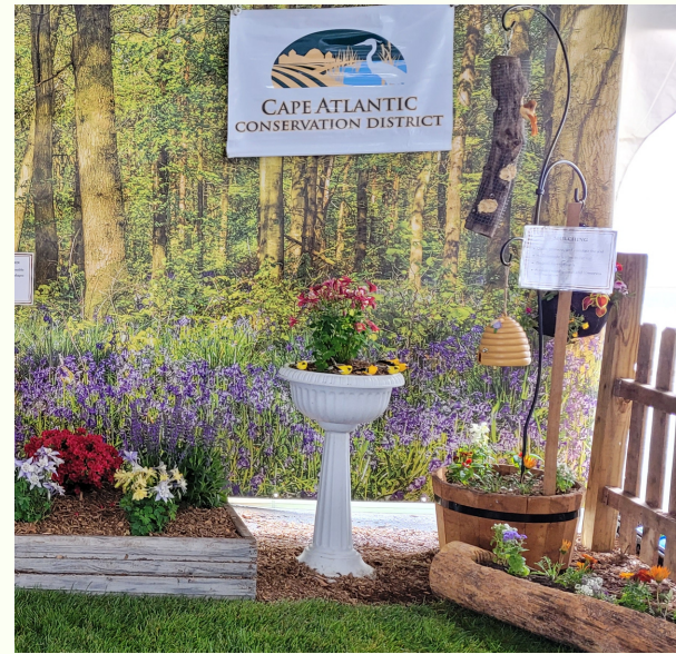
District educational display at the ACUA Earth Day!

The District looks forward to seeing everyone at these great events where you can learn more about the District, Backyard Conservation, our education programs, and agriculture offerings!